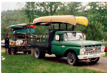
Old shuttle truck from Webbs

The shuttle to the Dead was once an adventure in itself. Grinning paddlers sharing exaggerated stories packed on the back of an old flatbed truck or into a rickety old school bus endured a bumpy,