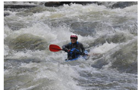
Magic Falls on the Kennebec