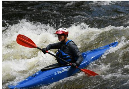
Lower Poplar on the Dead

dusty 45-minute ride to the put-in. The flatbed and bus are long since gone and replaced by pick-ups, but the stories are still good and the ride is still an adventure.