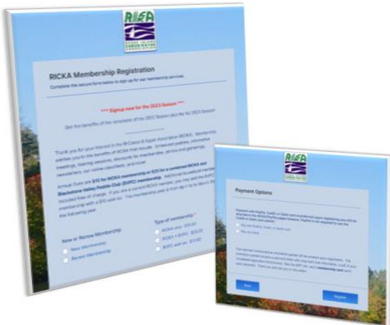
Registration is easy with our on-line form

Thank you for your support in the coming year, and we look forward to seeing you on the water.