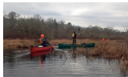
Exploring Poquiant Brook on the way back to Bradford Landing