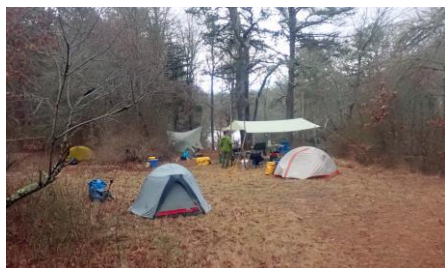
Camp set up in the field at the Burlingame Canoe Campsites

The weather forecast was mixed with a chance showers Saturday afternoon, day-time temperatures in the 40's, and night-time temperatures dropping into the 20's. I met the group at the Bradford Landing at 11:30 for the 4-mile trip up to Burlingame. With several inches of rain over the past two-weeks, the river was high and it was a bit of a slog paddling upstream.