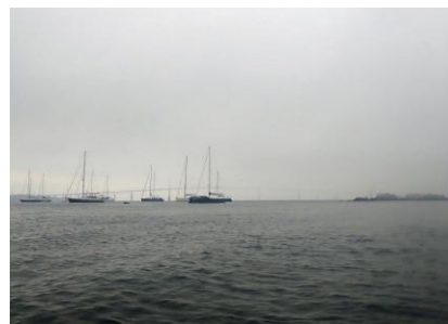
Newport Bridge in the fog

The wind was from the south and there were waves rolling in as we headed west through the cut-thru and around Bull Point. We stayed close to shore as we headed north along the fishing pier. The tide was