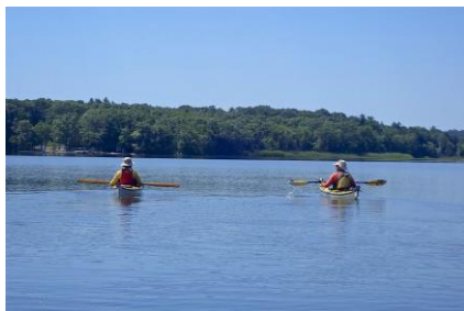
The Upper Pond

The Narrow River gets its name from either the long narrow section between Bridgetown Road and Middlebridge Road, or the narrow channel at the mouth of the river where it empties into Narragansett Bay. Both are referred to as the “Narrows”, so take your pick.