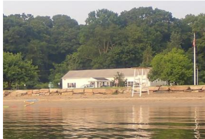
Cold Spring Community Center at the North Kingstown Town Beach

The 17 th annual RICKA Family Picnic will be held on Sunday, September 29 th at the Cold Spring Community Center at the North Kingstown Town Beach – a great location with gorgeous views of Narragansett Bay.