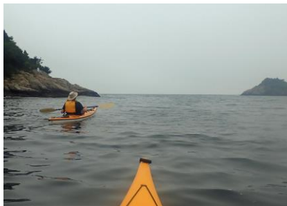
Heading out from Fort Wetherill

Fort Wetherill is a former coastal defense battery and military base located on the granite cliffs across the East Passage from Newport and Fort Adams. Shortly after the Revolutionary War, Fort Dumpling was built on this site to protect this strategic access to Newport Harbor and Narragansett Bay.