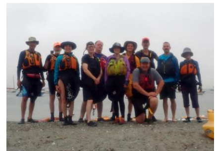
The crew on East Ferry Beach

From there it is an easy paddle around Jamestown Harbor. There are usually great views of the Newport Bridge, which spans the East Passage of the Narragansett Bay. Unfortunately for us, fog rolled in just as we were launching, and the bridge was obscured in the mist.