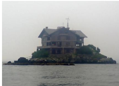
Clingstone – the "House on the Rock"

Today, Fort Wetherill is a state park and a favorite of many RICKA sea kayakers . From here they will often head north to the Dumplings for easy tide race play, or west to enjoy rock gardening along the southern shore of Conanicut Island, or