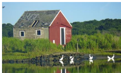
The Little Red Shack in Pettaquamscutt Cove in 2014

After paddling the Lower Pond you will pass under Lacey Bridge on Bridgetown Road. The river narrows here and is lined