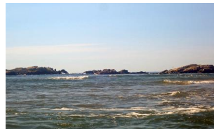
The Narrows at Cormorant Point

Established in 1973, the John H Chafee Wildlife Refuge includes over 300-acres of saltmarsh that provides habitat for shore birds like egrets, herons, cormorants and osprey. For many years, a little red shack stood on Sedge Island in the cove. The shack started as a summer camp, later served as the headquarter for a small lobstering company, and was an overnight destination for girl scouts paddling down from Camp Nokewa on the Upper Pond.