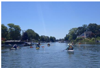
The Narrows between Bridgetown Road and Middlebridge Road

access the Narrow River –the town boat ramp at Pettaquamscutt Road , the Narrow River Fishing Area on Pollock Avenue, or the Sprague Bridge on Boston Neck Road (Route 1A). Except at the mouth of the river where it flows into Narragansett Bay, there is little current and the river can easily be paddled in both directions.