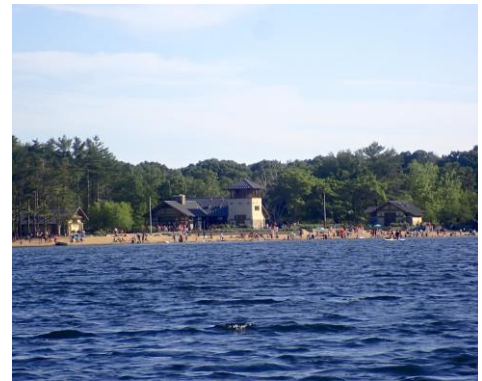
View of the beach from Olney Pond

We will put-in at the boat ramp and paddle around Olney Pond. Despite its proximity to major population centers, the pond is quite scenic with tree-lined shores, rocky outcroppings, small islands and many coves and inlets to explore. We will paddle over to sites 45/46 for camping demonstrations from our Wilderness group, and maybe even some snacks cooked on the campfire. Bring a headlamp or waterproof flashlight. Our leader for the evening will be Al Sampson wanderlust_bristol@yahoo.com .