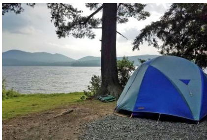
Great view for the night

I've been in RICKA for 44 years now, so I may be the club historian. I was also one of the members of the first Adirondack exploratory trip back in June 1983 - a 110 mile, 7 day trip on Fulton Chain of Lakes. Seven of us discovered the virtues of mile-long portages and lighting fires in heavy downpours. By consensus, future leaders insisted on doing day trips only with minimum gear requirements. Gone were the days of making seven portage trips complete with hair dryers and several cases of beer. I've gone on these summer paddling trips for no more than six times since then. This year's trip was August 5 - 12, 2023 at Lake Eaton campground, Long Lake Village, NY.