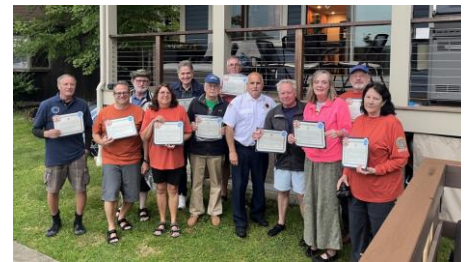
Blackstone Valley Paddle Club members receive special citation for service

The Blackstone Valley Paddle Club held its annual end-of-season celebration at Spring Lake in Burrillville, and they had a little something extra to celebrate.