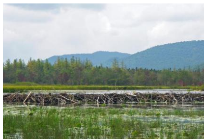
Beaver dam on the Miami River

We thought that we could meet the first day's paddle that Chuck scheduled at 10:00 a.m., but wisely decided to skip. Instead, we drove into Lake Lewey and paddled