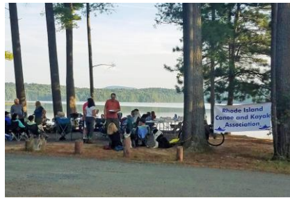
Big crew for Sunday night dinner