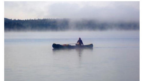
Wilderness Tripping on the Allagash Wilderness Waterway

The meeting will be held on Zoom video conference. Link will be posted on the website.