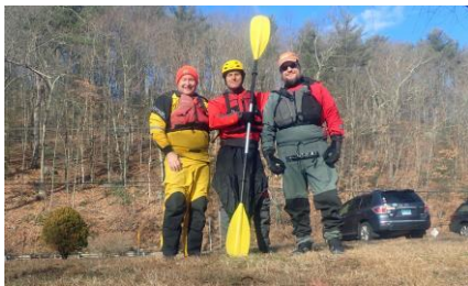
The three amigos at the put-in