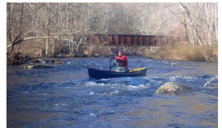
Jeff approaching the take-out

The river was at a nice level – 5-feet, 800 cfs on the Coventry gage and 2.7-feet, 500 cfs on the Merrow Road gage . To be honest, it would have been even better with another foot of water, but 5 feet is my new minimum for this run.