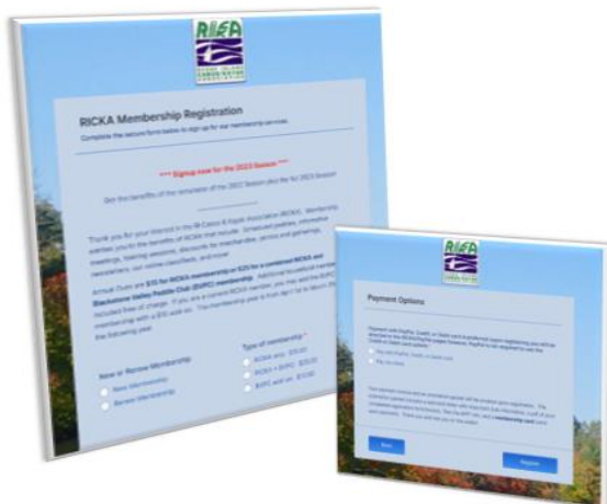
Registration is easy with our new on-line form