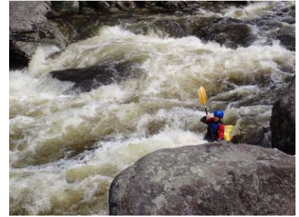
Running Dragon's Tooth

However, my pride was short lived after I entered and found myself not making the slot. I got pulled into Rodeo Hole and ejected after being unable to get my paddle above my torso to pull off a roll. A short swim later I was reunited with my boat and continued into the Labyrinth - a