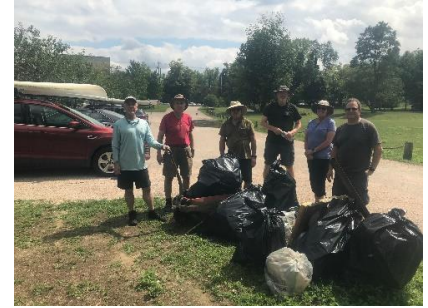
Volunteers at the clean-up

Thousands of pounds of debris were collected by over 2,000 volunteers. However, this is just the beginning! Many parts of the river still retain their scars from 200-years of industrialization as well as