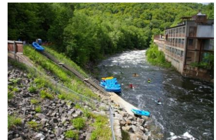
Staircase to the put in

Fortunately, this section of river builds in intensity as you go. Not long after the warmup II+/III rapids, you find yourself in