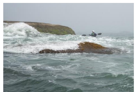
Playing in the rocks

Before lunch we headed to the point to surf