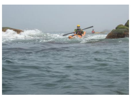
Catching a ride