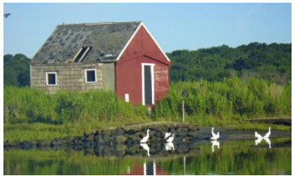
The Little Red Shack in Pettaquamscutt Cove in 2014

After paddling through Lower Pond will pass under Lacey Bridge on Middlebridge