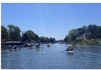
The Narrows between Bridgetown Road and Middlebridge Road

access the Narrow River – the <u>Gilbert</u> <u>Stuart Birthplace</u>, the <u>Town Boat Ramp at</u> <u>Pettaquamscutt Road</u>, the <u>Narrow River</u> <u>Fishing Area</u> off Pollack Avenue, and <u>Sprague Bridge</u> on Boston Neck Road. Except at the mouth of the river where it flows into Narragansett Bay, there is little current and the river can easily be paddled in both directions.