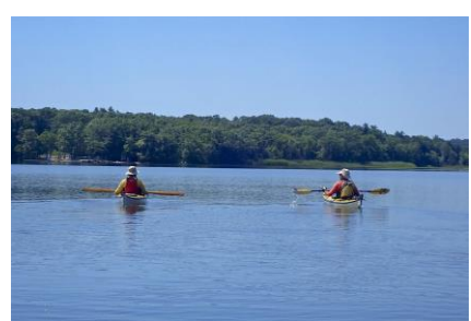
The Upper Pond

The Narrow River gets its name from either the long narrow section between Bridgetown Road and Middlebridge Road, or the narrow channel at the mouth of the river where it empties into Narragansett Bay. Both are referred to as the "Narrows", so take your pick.