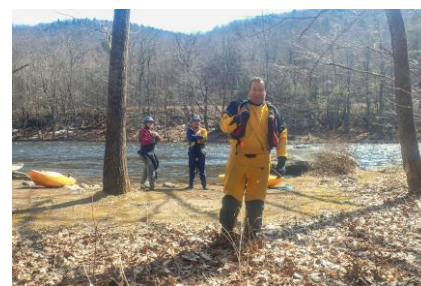
Hanging out at Miami Beach

We had scouted Zoar Gap on the way up, and decided that we were going to pass. With only three paddlers in the group, the higher water level and my mixed record running this rapid (7 for 14 with 5 swims and 2 walks), I was OK with that. Temp's hit 74 degrees, so it felt like spring even though there was still snow on the ground.