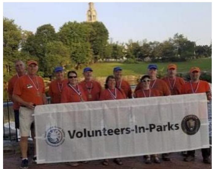
Blackstone Valley Paddle Club Leaders at the Founders Day Celebration at Old Slater Mill

The Blackstone River Valley National Heritage Corridor VIP program was recently awarded the George and Helen Hartzog Award by the National Park Service for outstanding volunteer programs. The Blackstone Valley Paddle Club has been an important part of the Volunteer in Parks program since its founding more than 20-years ago. The club has made it possible for thousands to get out and enjoy the beautiful waterways of the Blackstone River Valley.