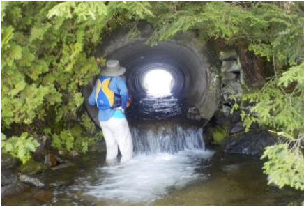
Hoel Pond Culvert

The weather can change quickly in the Adirondacks as our trip back across Hoel Pond demonstrated. The fair skies were quickly replaced by rumbles of thunder as we raced across the pond. We made it back to our vehicles without incident.