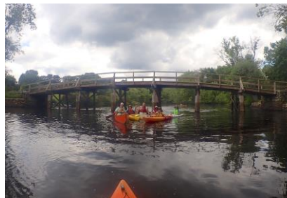
Old North Bridge at the Minuteman National Historical Site

We crossed Fairhaven Bay with barely a slight breeze in the air. We engaged in idle