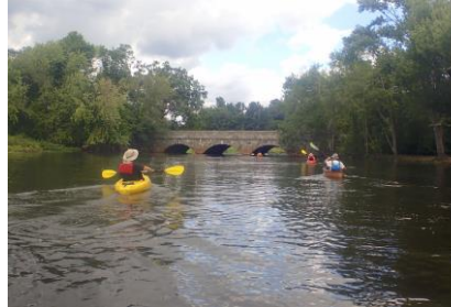
Stone Arch Bridges in Concord