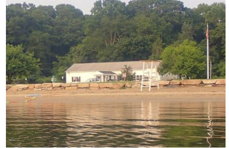
Cold Spring Community Center

Cold Spring Community Center at the North Kingstown Town Beach Saturday, September 25, 2021