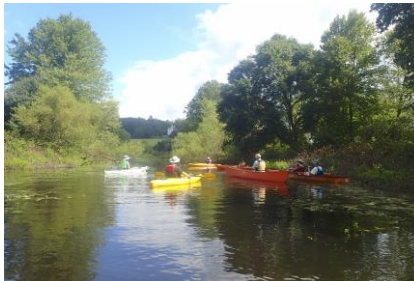
Put-in at the Lincoln Canoe Launch

The Sudbury is a National Wild and Scenic River , one of just 226 so designated in the country. It meanders for 33 miles in an easterly direction from Framingham to Concord. It is relatively flat and is known for its passage thru acres of grasslands and wetlands known as the Meadows. The area is popular with many visitors and has great historical value dating over 400 years from early colonial times. The shot heard around the world was fired here in 1775.