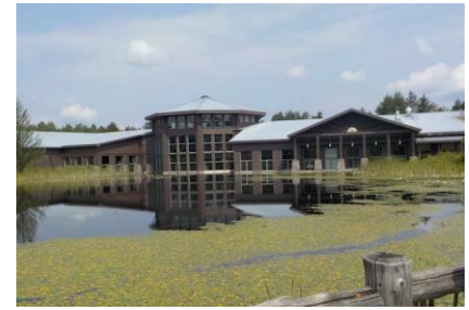
Great Camp Santanoni

Workers were just finishing up the installation of a new roof on this massive structure. It amazed me that you could go to a "camp" in the woods and travel from building to building without being exposed to the elements. We visited the boathouse, which has paddling gear that you can use for free. We took advantage of this and paddled Lake Newcomb and enjoyed lunch on a rocky beach.