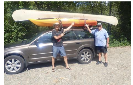
Boats loaded at the take-out for the return trip

We had to hurry it up as parking for kayaks was greatly lacking. We had taken over the beach. There was an opportunity to view more but time was pressing.