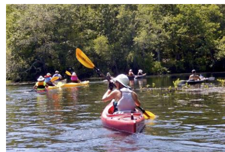
Paddling on the Upper Pawtuxet River

Our monthly "Meeting on the Water" isn't a meeting at all. It's a paddle that replaces RICKA's monthly meetings during the months of June, July and August. It's also a great chance to get together with fellow paddlers at a location that is suitable for everyone. This month's paddle will be on the Upper Pawtuxet River in Hope, RI. We will put in at the Hope Landing and paddle up to the Scituate Reservoir – a 4-mile round trip. The water is very clean, coming directly from the reservoir. We will meet at 6:00 for a 6:15 launch. Bring a headlamp or waterproof flashlight. Our leaders for the evening will be Chuck Horbert chorbert13@gmail.com 401-418-2838 and Cindy Gianfranco. GPS Coordinates: N41 43.868 W071 33.9