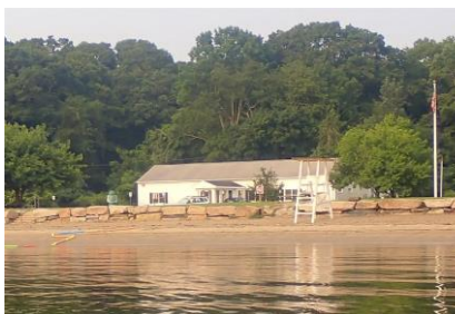
Cold Spring Community Center at the North Kingstown Town Beach

Lunch will be available starting at 1:00 at the Cold Spring Community Center. Options are available for vegan and all sandwiches will be made on gluten-free flatbread. The cost will be $13.50 per