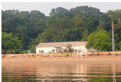
Cold Spring Community Center at the North Kingstown Town Beach

Lunch will be available starting at 1:00 at the Cold Spring Community Center. Options will be available for vegan and gluten-free. The cost will be $15.50 per