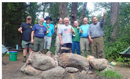
The traditional Molson Toast

It was celebrated with an assortment of French and French-Canadian delicacies – mostly wine and beer. A Molson toast around the fire was always the highlight of an evening filled with good food and good friends.