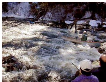
Running the Mohegan Rapid

After another half mile of quickwater was the Mohegan (now called the Atlas Pallet)