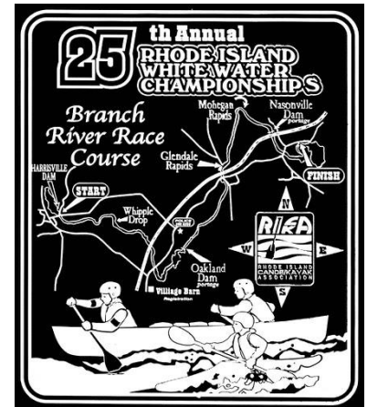
25 th anniversary race course map

The race was run on Rhode Island's only whitewater river – the Clear and Branch from Harrisville to Nasonville. The 7-mile