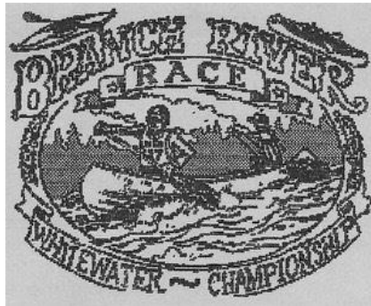
The original race logo

As with all RICKA events, safety was a principal concern. Safety checkpoints were set up at critical points along the route. From many years, the Ocean State Amateur Radio group partnered with RICKA to provide real-time communication between safety personnel on the racecourse, and those back at race headquarters.