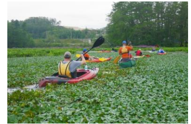
Padding through water chestnuts with purple loosestrife in the background – invasive plants above the Lackey Dam on the Mumford River