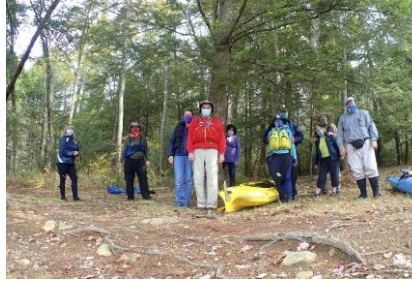
Join RICKA and be part of the fun – mask and all!

As you know, last season started out a bit slow. Out of an abundance of caution, we refrained from posting any paddles on our calendar in early to mid-spring and then slowly opened the calendar as we moved into summer. This season, however, we're throwing caution to the wind! Not really, but we have figured out how to offer paddles while adhering to COVID protocols.