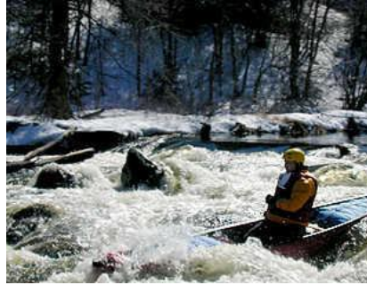
Running the Glendale Rapid