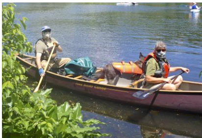
Join RICKA and be part of the fun – mask and all!

Why should you join RICKA? Let's start with the trips. Each year RICKA organizes trips ranging from easy daytrips to weeklong excursions. Whether you enjoy