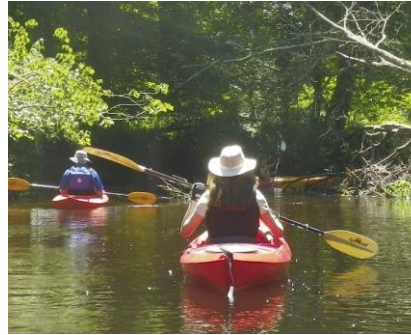
Summer day on a RICKA flatwater trip

Every paddler will need a boat (canoe or kayak) that is appropriate for the