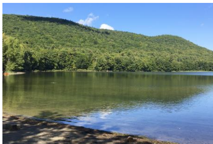
Moreau Lake State Park

First stop, Moreau Lake State Park campground in the Glens Falls, NY area for two nights. Alas, no water sites, but quite a nice campground - site was fairly private, actual bathrooms with tile, clean, biking and paddling opportunities. Particularly fun was biking the path through the woods around the lake. Glass more than half full!