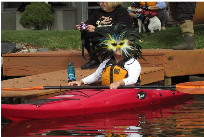
Halloween Monster Paddle – October 24 th