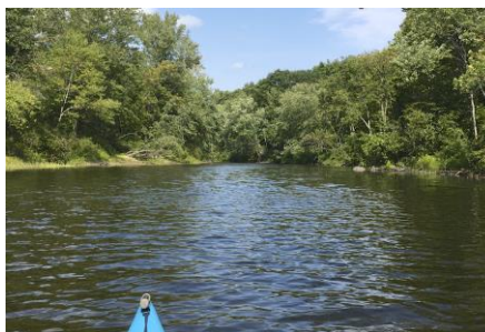
Paddling on the Schroon River

An easier choice for me was the Glens Falls Feeder Canal Towpath. Starting at the Feeder Dam, bikers can see the remains of