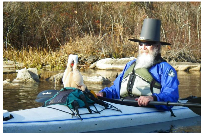
Turkey-less Turkey Paddle - November 7 th