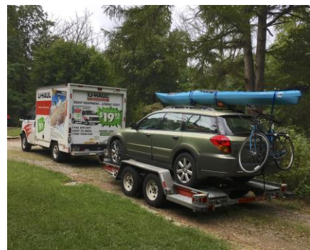
Back home in Rhode Island

No wireless phone service at the campground, but at least they had a landline. As I waited to be towed back to the repair shop, I enjoyed the quiet solitude of the lake and a great view of the mountains – can't wait to go back and actually camp there. Glass more than half full!