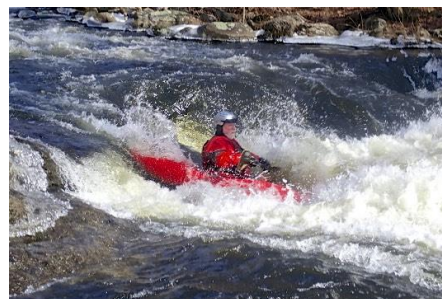
Running the Quaboag Drop in Devil's Gorge

We enjoyed some more easy rapids as we approached Angel's Field . This rapid doesn't require any fancy maneuvering. It's just a long run of rocks and large standing waves. Some of the yakkers caught eddies and did some surfing on the way down, but I was content to blast my way through the waves straight to the bottom. Four down, one to go.