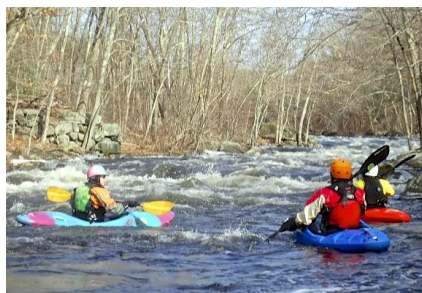
At the bottom of Angel's Field

Shortly after Mouse Hole is the Trestle Rapid . Once again the river takes a 90-degree turn before a long rocky drop under a railroad bridge. A straight run through this rapid is difficult due to a large group of boulders at the bottom. I was able to catch an eddy on the right half way down, which allowed me to line up on a narrow shoot through the boulders at the bottom. Two down, three to go.