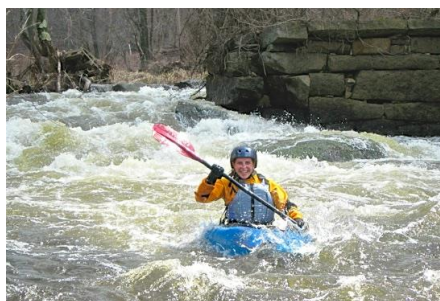
Running Mouse Hole

I arrived at the put-in at around 10:00, and was glad to see that a couple of paddlers were already unloading their gear. The sun was out and the sky was blue, but temperatures were in the mid-30's and there was a strong wind blowing, so we knew it would be a chilly day on the water. We would be running a popular whitewater section of the Quaboag River in central Massachusetts.