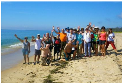
Join RICKA and be part of the fun!

Are you looking to improve your paddling skills? Training is also an important part of the RICKA mission. Each year RICKA offers many fun and informative training