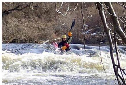
Running the Broken Dam

Eight paddlers had gathered to do the trip - two canoes and six kayaks. Along the way we would run five major rapids – Mouse Hole, the Trestle, the Broken Dam, Angel's Field, and the Quaboag Drop in Devil's Gorge.