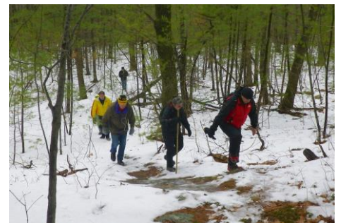
Up an icy slope

Snow and ice are the joy and the bane of winter hiking. Icy conditions can become particularly treacherous on hard packed, well-used trails. No one wants to slip and fall, so micro spikes are a good investment to help improve your traction. Yaktrax or Stabilicers are popular options.