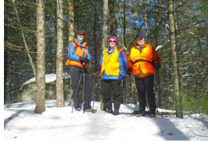
Dressing in layers

away from cotton - water repellent fabrics such as polypropylene are a much better option.