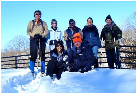
The RICKA crew hits the trail

Whether you're hiking for a few hours, or a few days, you don't want to have an "uh-oh" moment on the trail, when you realize you've forgotten something important. Make a gear list before heading out to make sure you have everything you need. In addition to your basic hiking gear, your list should include water, snacks, extra cloths, a headlamp, a first aid kit and other emergency gear. A light daypack will help you keep things organized.