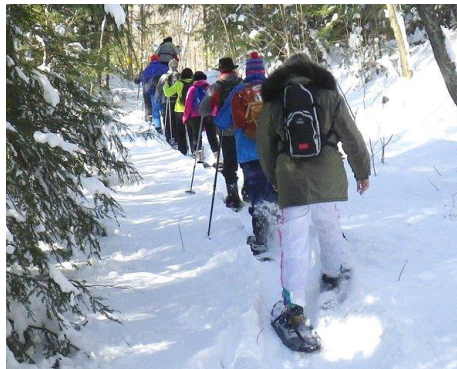
Snowshoes in light powder

For winter hiking, you will need comfortable, waterproof boots with a good tread, and good hiking socks. Hiking socks are usually made from wool or wool blends