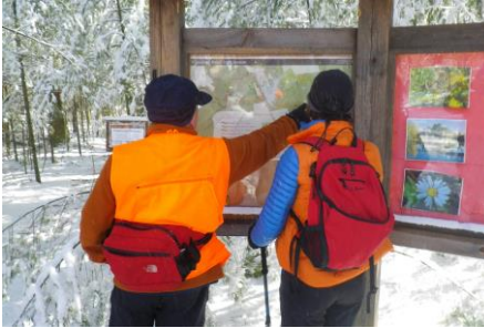
Checking the map

When planning your trip, be reasonable about the distance and difficulty of the trail. Ice and snow will reduce the distance you can travel compared to summertime conditions. Bring a map that includes landmarks and trail junctions, and be ready to adjust your trip as conditions warrant.