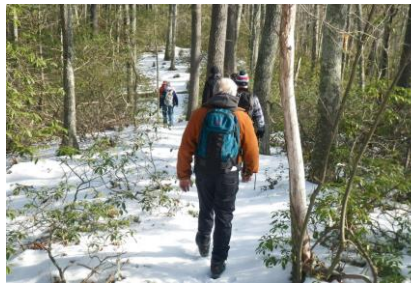
Stay fueled and hydrated on the trail

Hiking in the cold, especially in the snow, burns a lot of calories. By some estimates, hikers will burn 50 percent more calories hiking in the winter compared to a similar distance and terrain in the summer. Snacking frequently will keep your energy level up and keep you from getting chilled, so bring plenty of high-energy snacks.