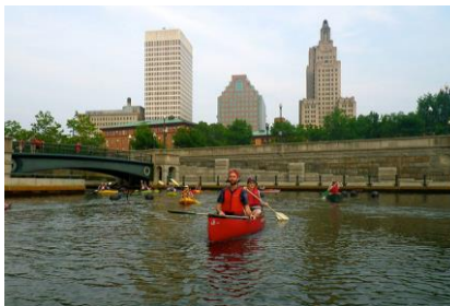
Join RICKA and be part of the fun!

Are you looking to improve your paddling skills? Training is also an important part of the RICKA mission. Each year RICKA offers many fun and informative training sessions. Many of these sessions are