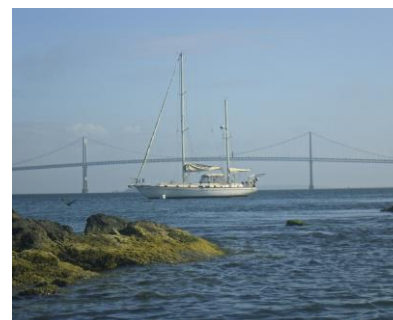
Newport Bridge from the Dumplings