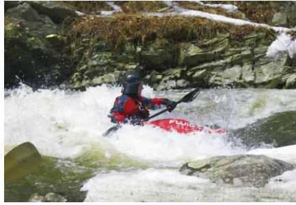
Duke Wavewalker surfing the Gorge Drop on the Knightville section of the Westfield River

Please note that these bootleg trips are not official RICKA trips. They are posted for the convenience of our paddlers. As always, you are responsible for determining if the trip is suitable for your level of experience.