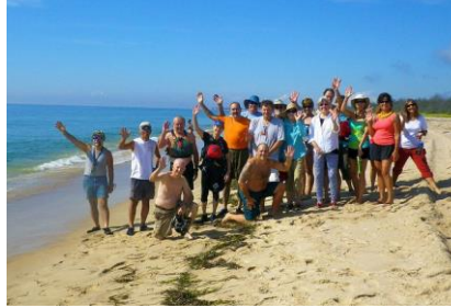
Join RICKA and be part of the fun!

For 41 years, the Rhode Island Canoe & Kayak Association (RICKA) has been providing great paddling opportunities for it's members. We are the oldest and largest paddle sport club in Rhode Island. A new membership year begins on April 1 st , so please join or renew your membership today.