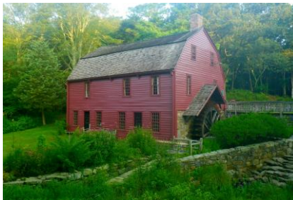
The waterwheel at the Gilbert Stuart Birthplace on the Narrow River

In Rhode Island, dams have been built on local rivers since Roger Williams and the colonists first settled in Providence in 1636. Initially, dams were built to power small sawmills and gristmills to serve the needs of local farmers. A fine example of these early mills is the Gilbert Stuart Birthplace on the Narrow River .