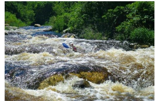
Paul running the rapids in the restored Lower Shannock Falls

Perhaps nowhere has dam removal and river restoration been more active than on the Pawcatuck River . In 2010, the Lower Shannock Falls Dam was removed and replaced with a short rapid that allows fish to swim upstream, and paddlers to run downstream.