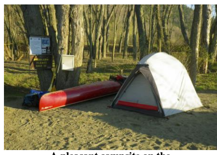
A pleasant campsite on the Upper Connecticut River

Please note that these bootleg trips are not official RICKA trips. They are posted for the convenience of our paddlers. As always, you are responsible for determining if the trip is suitable for your level of experience.