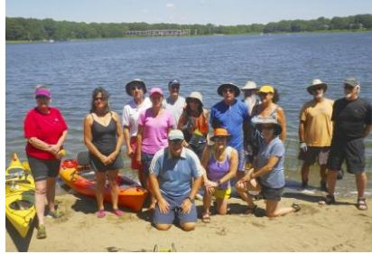
Join RICKA and be part of the fun!

Are you looking to improve your paddling skills? Training is also an important part of the RICKA mission. Each year RICKA offers many fun and informative training