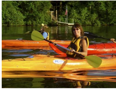
Summer day on a RICKA flatwater trip

Every paddler will need a boat (canoe or kayak) that is appropriate for the conditions, paddle and personal floatation device (PFD). Your PFD must be zipped, buckled and properly adjusted anytime that