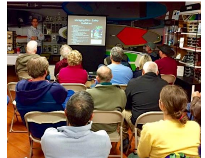
Last year's meeting at the Kayak Centre

With locations in Wickford and Charlestown, the Kayak Centre has been a longtime RICKA partner providing high quality programs and a large selection of boats, paddleboards and other gear. RICKA members also receive special discounts through our Member Discount program. See the RICKA website for details. The Kayak Centre is located at 70 Brown Street in Wickford Village.