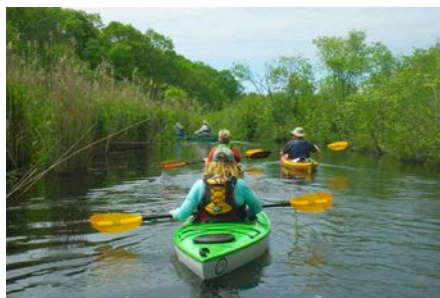
Heading down the Chipuxet River