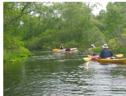
Approaching Biscuit City Landing

Whatever it is called, the river itself is beautiful. It twists and turns through a pretty hardwood swamp covered with vines – especially poison ivy, which grows so lush that I saw leaves as big as my hand drooping down from many trees. We stopped for a look at the huge impound of the Great Swamp Management Area, and watched as an Osprey brought a fish back to its nest high atop the power lines.