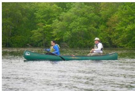
Crossing Worden Pond

We put-in on the Chipuxet River at Taylor's Landing , and headed south through the Great Swamp Management Area. At times, shrubs and swamp grass almost overgrew the river. Fortunately, due to higher water levels, we were able