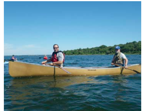
Padding a tandem canoe at the 2016 RICKA Picnic