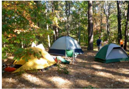
RICKA campers at the Burlington Canoe Campsites on the Pawcatuck River

Please note that these bootleg trips are not official RICKA trips. They are posted for the convenience of our paddlers. As always, you are responsible for determining if the trip is suitable for your level of experience.