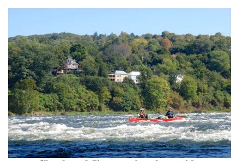
Chuck and Jim running the rapids

As it turned out, we only had rain on that first day, and intermittent at that. Every day the weather improved. For most of the trip, we would wake up to thick fog that would not disperse until we had paddled for a while. The wind was never an issue and most days would clear to blue skies and 70 degrees.