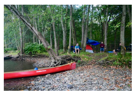
Camping at Crulls Island

Camping is available along the river, but campsites aren't exactly evenly distributed. Out first day was about 17- miles of paddling to get to Crulls Island, the first of a number of river islands that are part of the Allegheny National Forest.