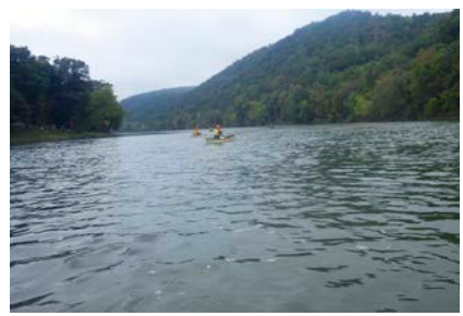
Put-in at Kinzua Dam

It was enough to come up with a plan, though, so plans were made and on October 1, 2016, six paddlers converged on the small town of Emlenton Pennsylvania to our cabins at the Gaslight Campground.