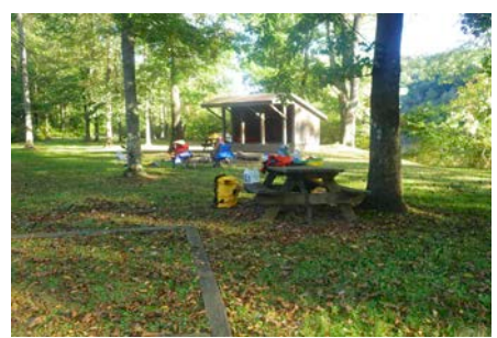
Rail Trail Lean-to Shelters

The next known nice campsite was at a place known as Danners Rest, but getting there would have meant a 35-mile marathon on day 4, so we decided to investigate some rail trail sites alleged to exist along the Allegheny River Trail, which is a former railroad turned into a bike path that runs along the river here. It still meant a 24.5-mile day for us, but the river is constantly moving and the