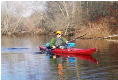
SuAsCo AI – the Trash Paddler

Most people recognize Neponset Bay, which is where the natural gas tank is when you drive into Boston on the Southeast Expressway (Route I-93 North). We were paddling on the headwaters that begin in Foxboro, MA.