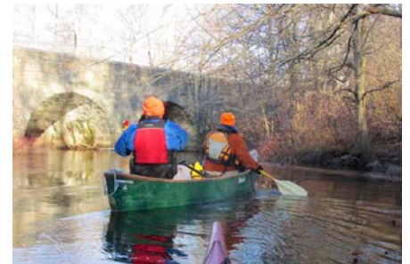
Approaching Paul's Bridge in Milton

After lunch we pushed on and passed under Routes I-95 and 128 and paralleled the train tracks. The river valley was isolated, wooded, and blow down free. We chatted and basked in the afternoon sun. We still saw little evidence of mankind. There were nice tree lined banks of white and silver birches. With no vegetation we could see far into the woods, but we saw few houses.