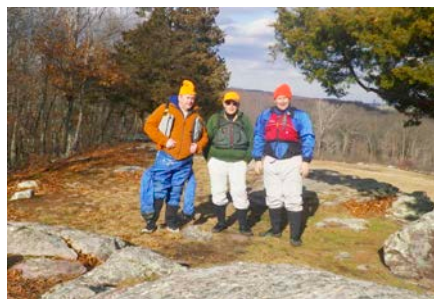
Top of Signal Hill with a view of Boston

We continued another 3 miles and stopped for lunch at Signal Hill , a Trustees of Reservations site with good river access. After lunch we climbed a few hundred feet