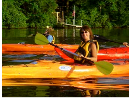
A great summer day on a RICKA flatwater trip

Every paddler will need a boat (canoe or kayak) that is appropriate for the conditions, paddle and personal floatation device (PFD). Your PFD must be zipped, buckled and properly adjusted anytime that