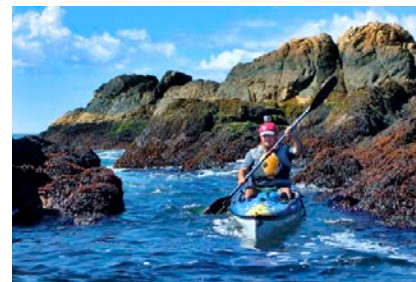
A little playtime

Everything turned out fine in the end. Still it was a reminder that all paddlers need to be cognizant of their limitations and make smart judgments about their ability to safely participate in a paddle. I know it isn't always easy. I struggle with it often. I remember the glory days when I paddled every weekend and was more than able to tackle just about any paddle on the schedule. Now that I am older and don't paddle nearly as often, I cannot, with confidence, do the same.