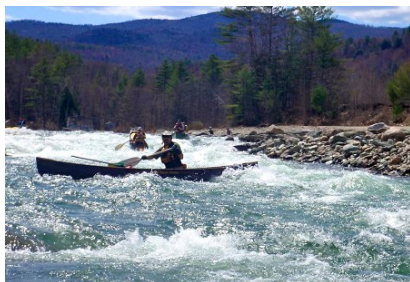
Flushed sideways and headed for the eddy

About a quarter mile above Z-turn is now the toughest rapid on the river, where the channel is very narrow and drops steeply into a pool, with violent standing waves 3-feet in height. It can be somewhat sneaked by staying left of center, but I ran the main