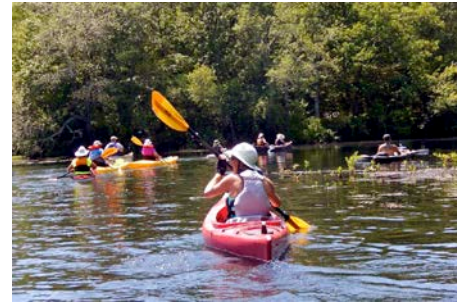
Paddling on the Upper Pawtuxet River

Our monthly "Meeting on the Water" isn't a meeting at all. It's a paddle that replaces RICKA's monthly meetings during the months of June, July and August. It's also a great chance to get together with fellow paddlers at a location that is suitable for everyone. This month's paddle will be on the Upper Pawtuxet River in Hope, RI. We will put in at the Hope Landing and paddle up to the Scituate Reservoir – a 4-mile round trip. The water is very clean, coming directly from the reservoir. This trip is suitable for all boats and levels of experience. We will meet at 5:45 p.m. for a 6:00 p.m. launch. Our leader for the evening will be RICKA Flatwater Chair Cheryl Thompson . GPS Coordinates: N41 43.868 W071 33.9