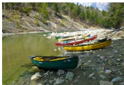
Lined up and ready to go