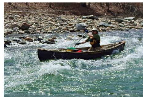
Enjoying the day

A few boats didn't make it through upright, and none made it through very dry, but it was an exhilarating ride! Things calmed down considerably after the Gaysville Bridge, and it was a fine float in the sunshine down to our take-out at a park in Bethel.