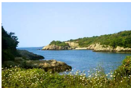
The put-in at Fort Wetherill

This weekend presented a dilemma: go for the sure thing or risk it all for an epic paddle? Saturday's paddle was Fort Wetherill to Newport. Sunday's paddle was a circumnavigation of Fisher's Island. My preference was for the Fisher's Island paddle. It was out of the ordinary and offered plenty of chances for fun. The weather, however, preferred Saturday's paddle. The forecast for Saturday was OK. The forecast for Sunday was bad with a slight chance of less bad.