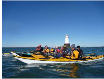
RICKA paddlers off Sakonnet Point in Little Compton

Surf and rocks present special dangers to paddlers. Surf is unpredictable and powerful, and rocks can smash you or your kayak. Only skilled paddlers should venture into these conditions.