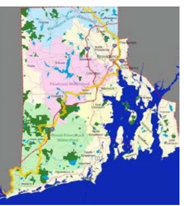
Chuck's route across Rhode Island

So I started looking over maps and spending a lot of time scrolling through the aerial photographs on Google Earth. Problem spots, or sections I knew little about, were targeted for additional scouting