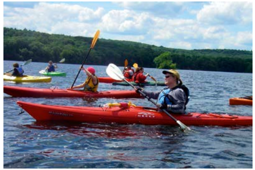
Join us for an evening paddle on Harrisville Pond

Our first on-water meeting/paddle of the season is the signal that summer is here! For those new to the club, a group paddle replaces the more structured meetings of fall through spring, and takes place on the third Monday evening of the month. This month's meeting/paddle will be held at the Nipmuc River and Harrisville Pond in Burrillville, RI. This river is listed by the state as pristine water, the state's highest rating for water quality. We will meet at the