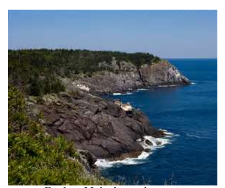
Explore Maine's scenic coast on the Maine Island Trail

The Maine Island Trail Association (MITA), a non-profit organization with almost 3,800 members, operates the trail. Detailed information about each site is contained in the association's Trail Guide. which updated annually and available only with MITA membership. To ensure good stewardship along the trail, it is important for all visitors to plan their trip using the most recent Trail Guide.