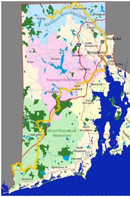
Route of Paddle Across Rhode Island in yellow

Aside from the personal challenge of completing this historic canoe trip, I also will be coordinating small PR events to both promote the goals of Rhode Island Blueways Alliance to develop water trails throughout the state and improve access to them, as well as to highlight the great work that municipalities and non-profit groups