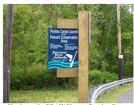
Check out the PRAWC's new Pontiac Canoe Launch and Howard Conservation Area

We offer group canoe/kayak trips, river cleanups and river festivals. Our monthly meetings are also open to the public. Additional information is available at www.pawtuxet.org