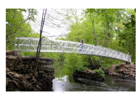
The new Polly Coon Bridge over the Pawcatuck River

The approximately 550-acre Westerly Grills Preserve has an extensive network of