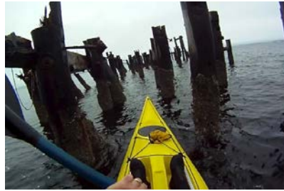
Pilings at the north end of Gould Island

It's a 5 mile round trip from Potter's Cove that I can do in an hour or less, depending on conditions. The northern part of the island is an old Navy building that was involved with testing torpedoes. It is on pilings, so unless the tide is high, you can paddle under it. If there's a significant chop, it makes for interesting kayaking.