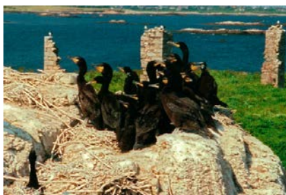
Huddled mass of cormorants

West Island is one of several small islands and rocks off of Sakonnet Point in Little Compton, R.I. Hundreds of seagulls and cormorants can be seen there. Sakonnet Point is one of RICKA's most popular rock garden venues, and West Island, with its surrounding rock gardens and a protected pool, is always one of our favorite stops.