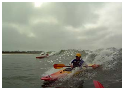
Surfing at the K's on a small day

One of my favorite breaks is actually within a system of three jetties, with two large gaps open to the exposed ocean. Waves, passing through these gaps, are refined and cleaned up...yes, they are a bit