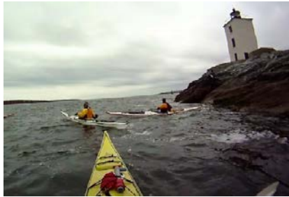
RICKA paddlers near Dutch Island Light

gun emplacements from the Civil War and beyond. Trails course through the island, especially at the perimeter near the water. I've camped there several times, often with some of my kids and their friends. Dutch Island is great for just watching the stars on a clear summer night. Dutch Island is still a place I visit often, either alone, with my wife, or on a RICKA paddle.