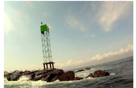
Galilee Jetty, Point Judith...some 10 miles beyond lies Block Island

The 10 mile crossing to Block Island was actually uneventful, but I was glad I took a GPS unit as well as a compass...the angle our path made with the lighthouse on the north of Block Island changed VERY slowly, and it was reassuring to see via the GPS that we were, in fact, advancing toward our goal.