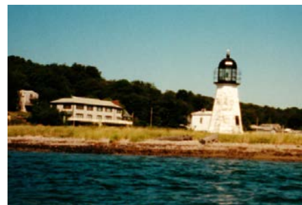
Sandy Point Lighthouse on Prudence Island