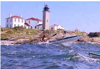
Tony in the X2 at the lighthouse

One of the most scenic and exposed-coast locations in R.I. is Beavertail. It is located at the southern end of Jamestown, and is almost an island (being connected to the rest of Jamestown by a narrow causeway). It's shaped like a...well...a beaver's tail. Cliffs, rock gardens, pocket beaches, a sea cave, walking paths, fantastic fishing, open water conditions, and the second oldest in-use lighthouse in the U.S. (it has a small museum and a nature area/aquarium also)...it's a virtual paradise for anyone who loves the exposed coast.