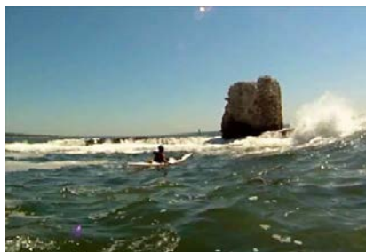
The stone foundation is all that remains of the former lighthouse

Whale Rock is a frequent stop for R.I. kayakers when crossing from Narragansett to Beavertail Point in Jamestown. As we play in the rocks and passageways of