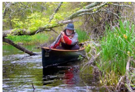
Charles River below Worden's Pond