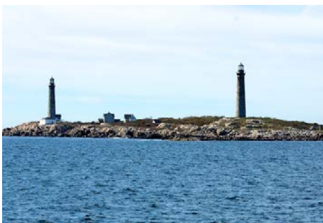
Twin lights on Thatcher's

We met at Back Beach in Rockport. It is a popular place for divers and provides good