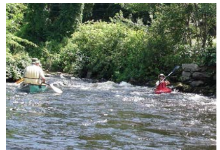
Pawcatuck River at Burdickville