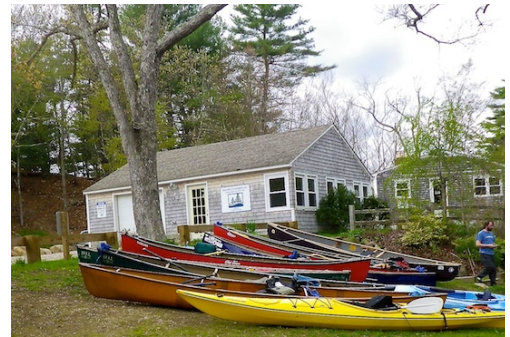
Canoes and kayaks outside the WPWA headquarters on a recent RICKA Trip.

Directions to the Jewish Community Center: From Rt. 95 South take Exit 24 and turn left onto Branch Avenue. From Rt. 95 North take Exit 24 and turn right onto Branch Avenue. Go past Benny's. Cross North Main Street and continue up the hill (past Kentucky Fried Chicken). At the top of the hill cross Hope Street and continue one block to the end at Morris Avenue. Go left, then immediately right onto Sessions Street. Go down the hill to Elmgrove Avenue. The Jewish Community Center will be across the street. Please follow the signs and enter on Elmgrove Avenue and exit on Sessions Street.