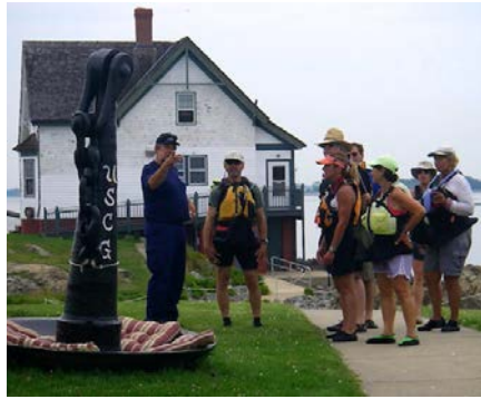
Learning the history of Georges Island with a Coast Guard Auxiliary Member

Back in the boats, we headed to Shag Rocks to play a little bit. There was very little swell so the danger level was low. We