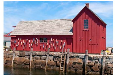
Motif Number One in Rockport Harbor

The north tower was open when we were there. Getting to the top was a slog. The stairs wind up in the dark tower for seven or eight flights. Once at the top, we checked out the disappointing views from inside the light housing. It was hazy and the plexiglass made it worse. As we started down, we discovered the door to the outer landing. The view from the landing made the climb worth it. Even with the haze and the fog you could see for miles.