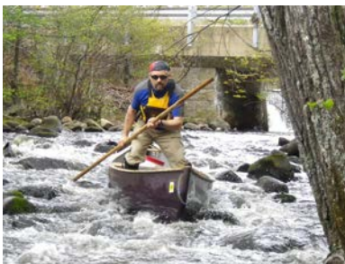
Wood River below the Barberville Dam

The Wood Pawcatuck Watershed Association is located at 203 Arcadia Road, Hope Valley, RI 02832. You can reach them by email - info@wpwa.org , telephone - (401) 539-9017, or visit their website at http://www.wpwa.org/