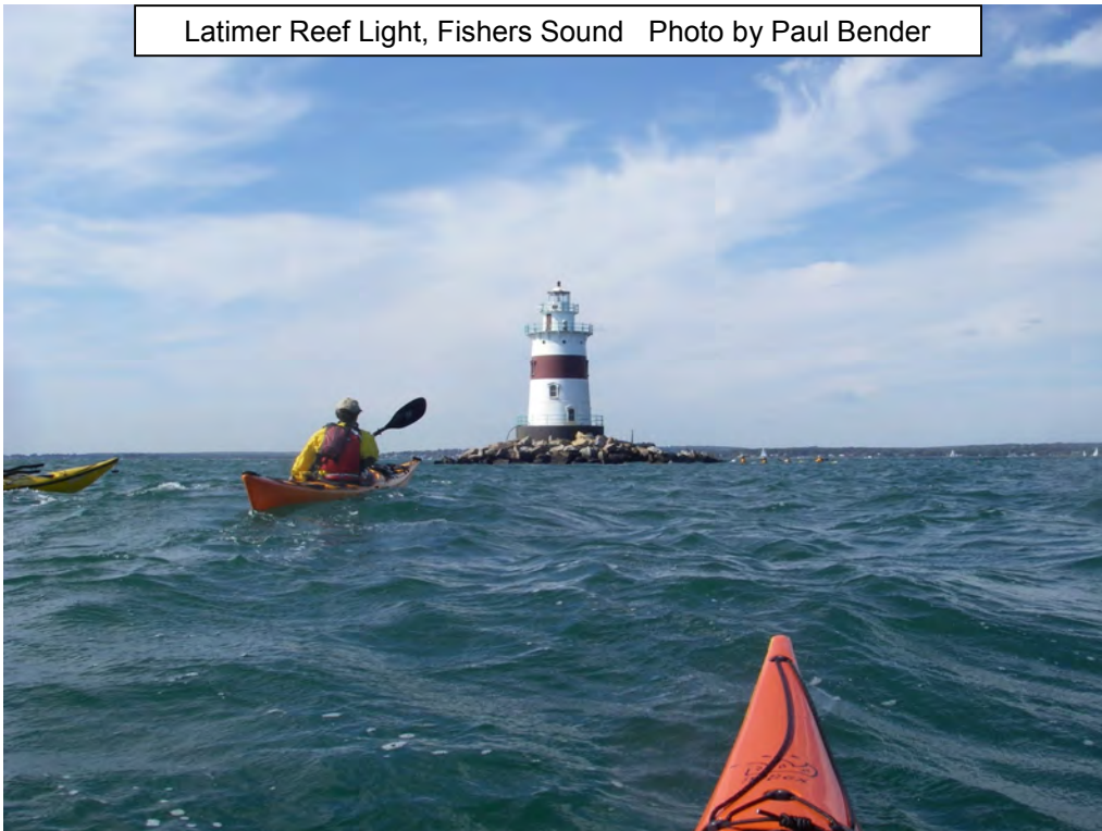
Latimer Reef Light, Fishers Sound