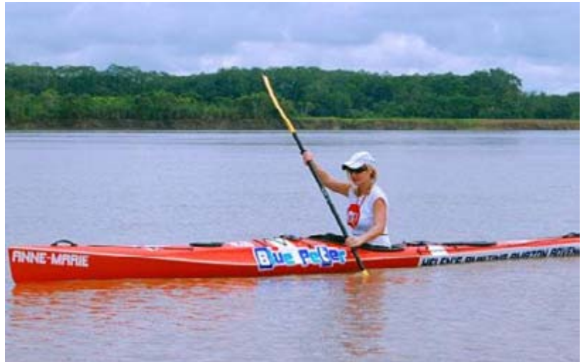
Helen Skelton steers her 15-kilo boat along the crocodile-infested river

Last year, she proved her point when, in April, she became the second woman to complete the 78-mile ultra-marathon in Namibia, running the three consecutive marathons in 23 hours and 50 minutes. So this year, when Blue Peter decided to stage a stunt to raise awareness for Sport Relief , Skelton