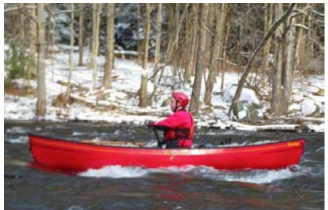
Jeff approaching the Boateater Rapid

We put in with the group and began working our way downstream. The scenery was pretty with a new coat of snow on the ground, but it was colder than I expected. There are actually four sets of rapids on the upper section of this run, each becoming more difficult as you move downstream. The longest is a nice class II known as the Crystal Rapid for which this section of the river gets its name. The Crystal Rapid has the best surf waves, so it is a popular place to practice and socialize. After an hour of playing in the waves, we decided that it was time to move downstream.