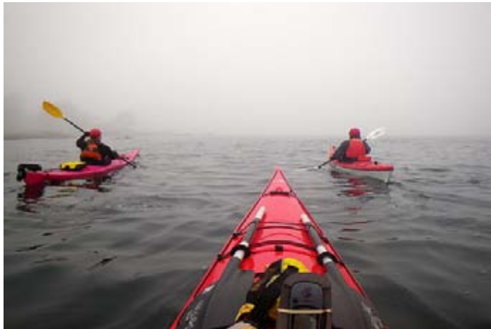
Uhhh...so is that Mackerel Cove or the East Passage??