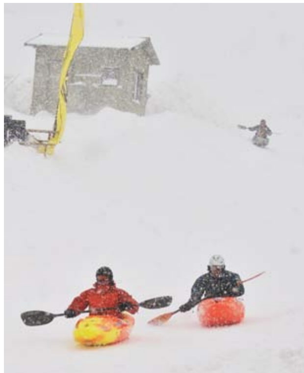
Snow kayaking Monarch Mountain

And if none of these grab you, I guess you'll just have to join these fanatics: